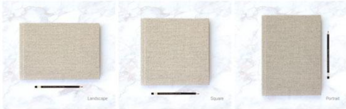
Photo book printing can be any style you want, landscape, square, portrait!

An impeccable finish for your hardcover fabric photo books printing!