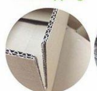
Double Layers Carton